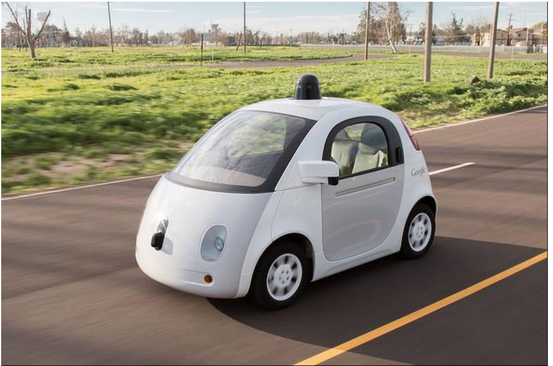
Google self diving car